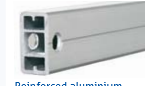
Reinforced aluminium crossbars