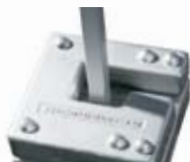
Stackable steel leg weights