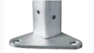
Hardened aluminium feet