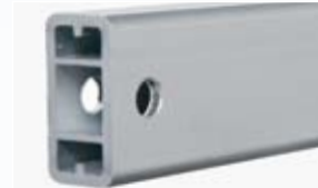
Reinforced aluminium crossbars