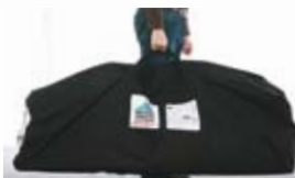
Marquee carry bags