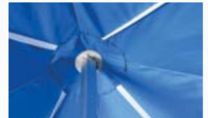
Heavy duty uprights