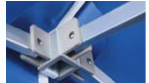
Sharp edge protectors